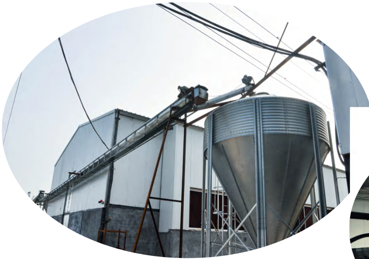
Efficient Feed Delivery