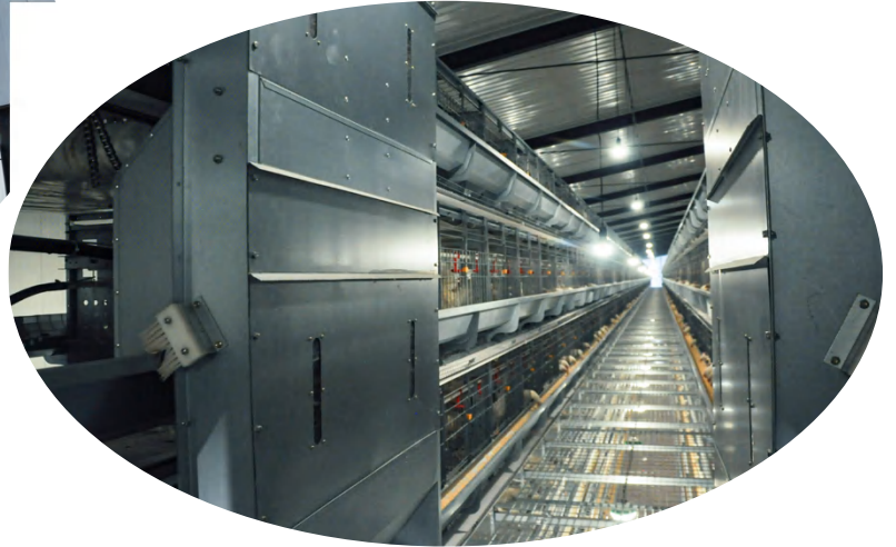
High Degree of Automation