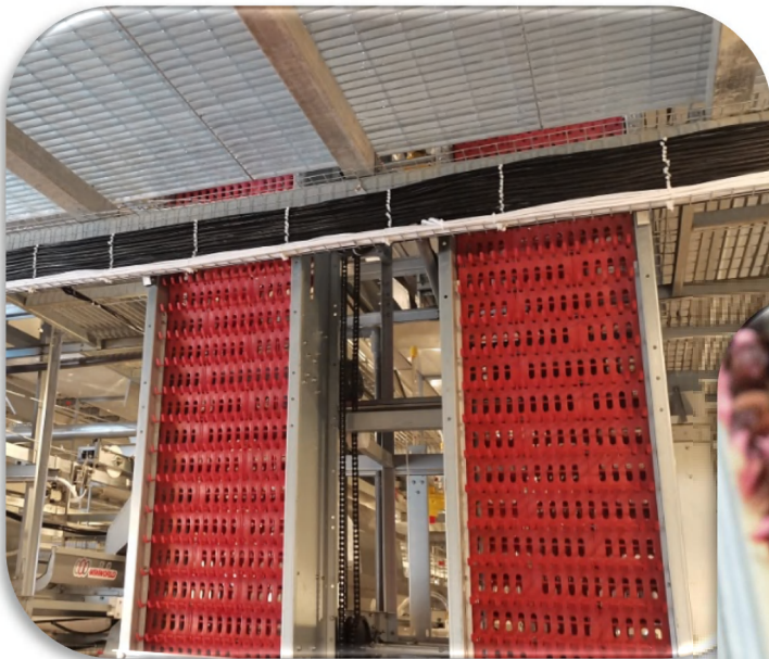
Efficient Egg Collection